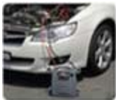
1.2 metre long leads allow easy connection without heavy lifting