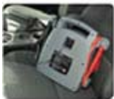
Convenient recharging from vehicle's cigarette lighter outlet