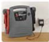
240V AC 500mA adaptor for recharging from 240V outlet