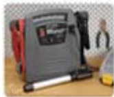
Cigarette lighter socket for powering your 12V DC appliances