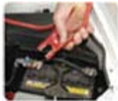
Surge protection increases safety for you and your vehicle