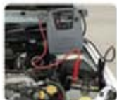
Instant starting power to get you back on the road